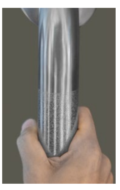
Optional safety grip finish available on all grab bars

Wide selection of configurations available