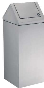
WR-14 SURFACE-MOUNTED WASTE RECEPTACLE